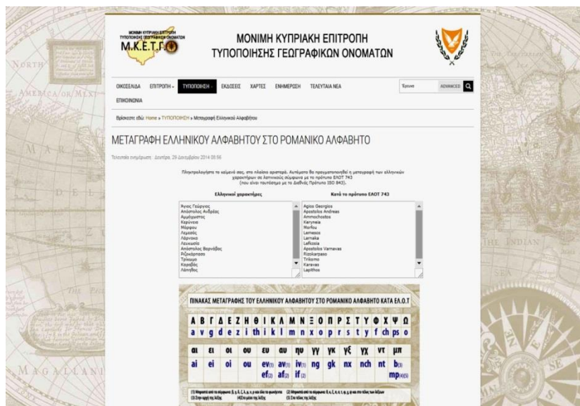
Fig. 1: Tool for automatic transliteration from greek to roman alphabet

http://www.geonoma.gov.cy/index.php/typopoiisi/metagrafi-ellnikou-alfavitou