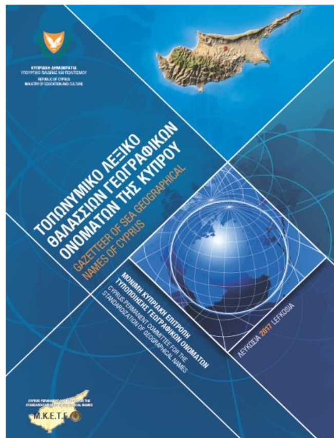
Fig. 3: Gazetteer of Sea Geographical Names of Cyprus

Hard copies of the book were delivered to government ministries and departments, academic institutions, semi-government organizations, associations, and many other interested organizations and persons. Hard copies are still made available for free to any interested organization or person.